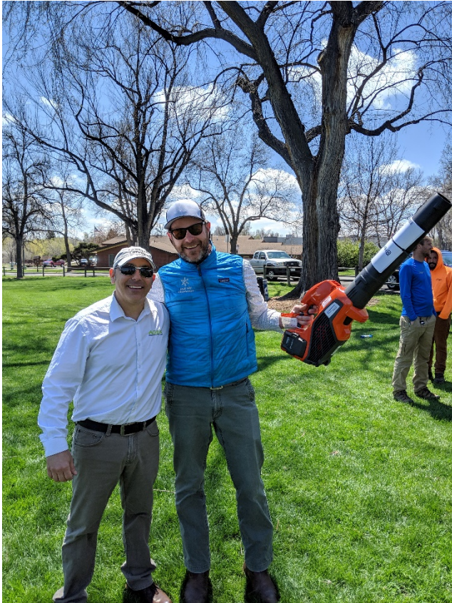
Electric Lawn and Garden Equipment Demonstration

This section lists the principles and policies that guide the City organization’s efforts in air quality. Principles and policies were adopted as part of City Plan—the City’s comprehensive plan—while associated strategies and actions in this Air Quality Plan are updated administratively.