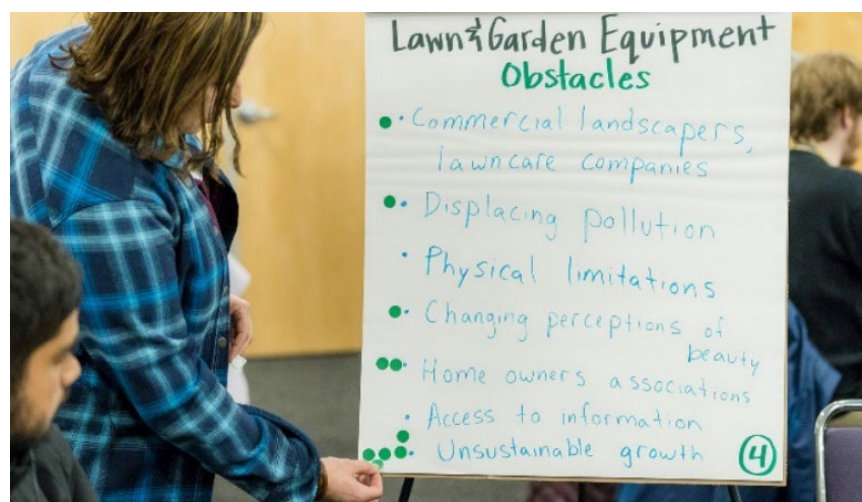
Collecting feedback on electric lawn and garden equipment programs at the March 6, 2019 Air Quality Community Forum