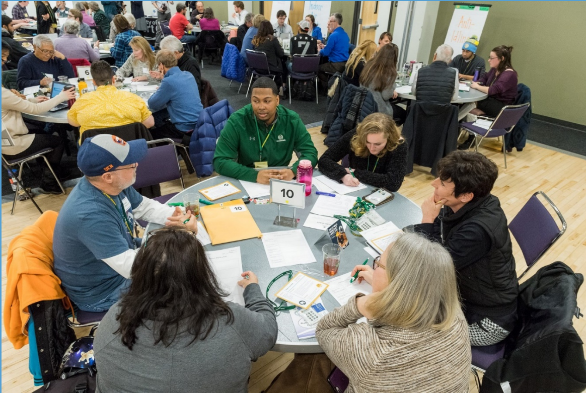
Air Quality Forum, March 6, 2019

The first Air Quality Plan was adopted in 1993 and has undergone periodic updates and revisions every five to 10 years. 3 This Air Quality Plan was developed in coordination with the City's 2019 comprehensive plan update, which includes long-term land use and transportation planning principles and policies. City Council adopted the revised City Plan on April 16, 2019, and air quality principles, policies and strategies from the City Plan are repeated here. Specific action items in this Plan are updated administratively, and informed by consultation efforts with the community, regional partners and stakeholders including: