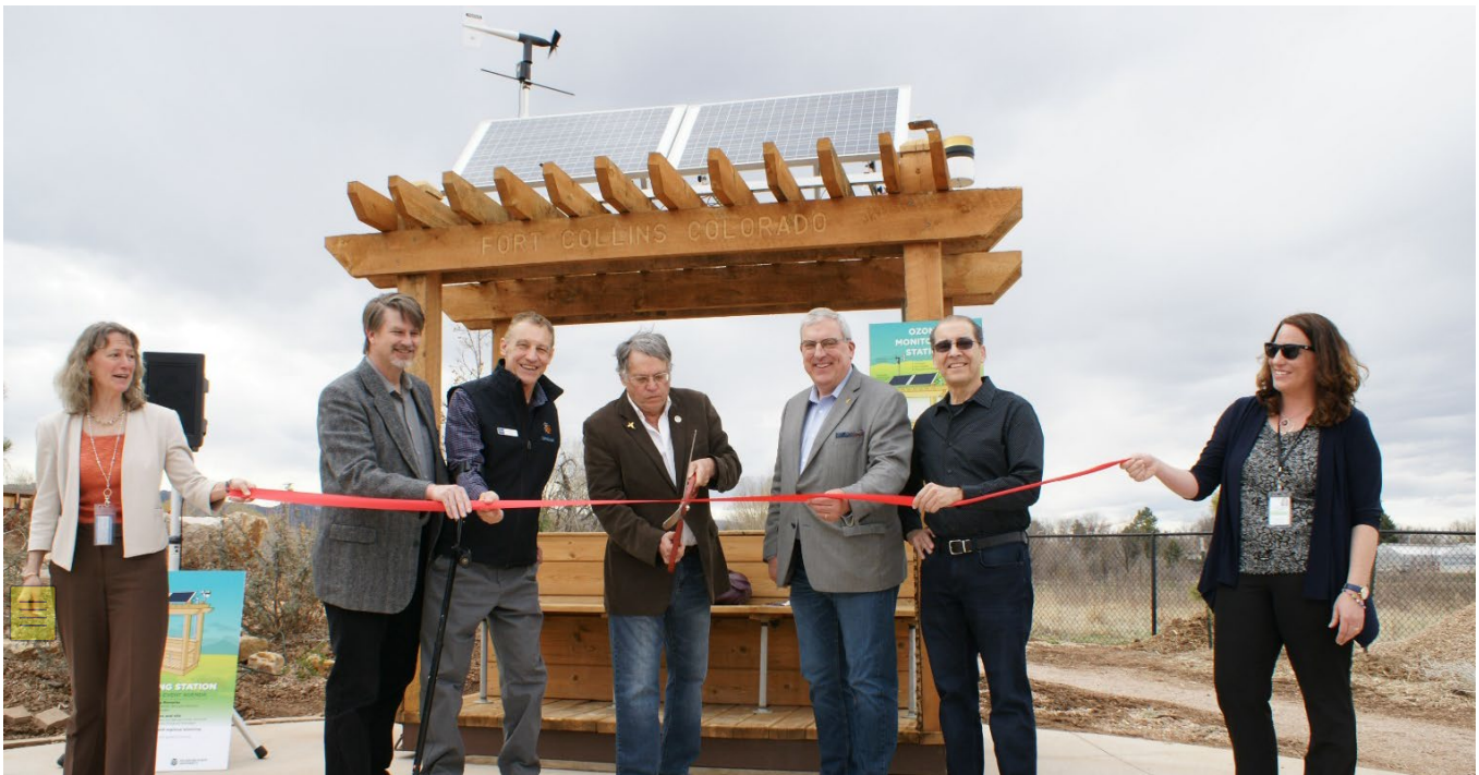
Ozone Exhibit, Fort Collins, CO