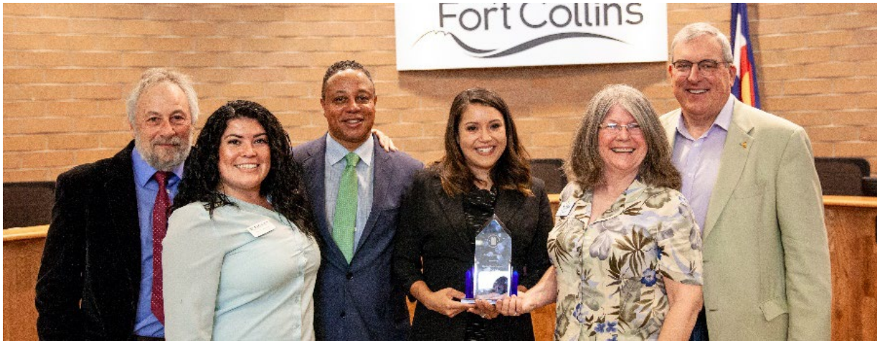
2018 HUD Secretary's Award for the City's Healy Homes Program