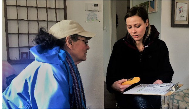
Testing for Carbon Monoxide during Healthy Homes Indoor Air Quality Assessment

Indoor air quality is also a major health concern, and it can often be worse than outdoor air. Poor indoor air quality has been tied to asthma attacks, headaches, fatigue, trouble concentrating, and irritation of the eyes, nose, throat and lungs. Additionally, long-term exposure to indoor pollutants such as asbestos and radon can lead to lung cancer. 7 Sources of indoor air pollutants can include consumer products, such as paint, cleaning and personal care products, combustion sources such as ovens and fireplaces, and other household materials.