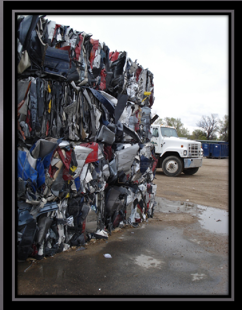
Colorado Iron & Metal, Fort Collins