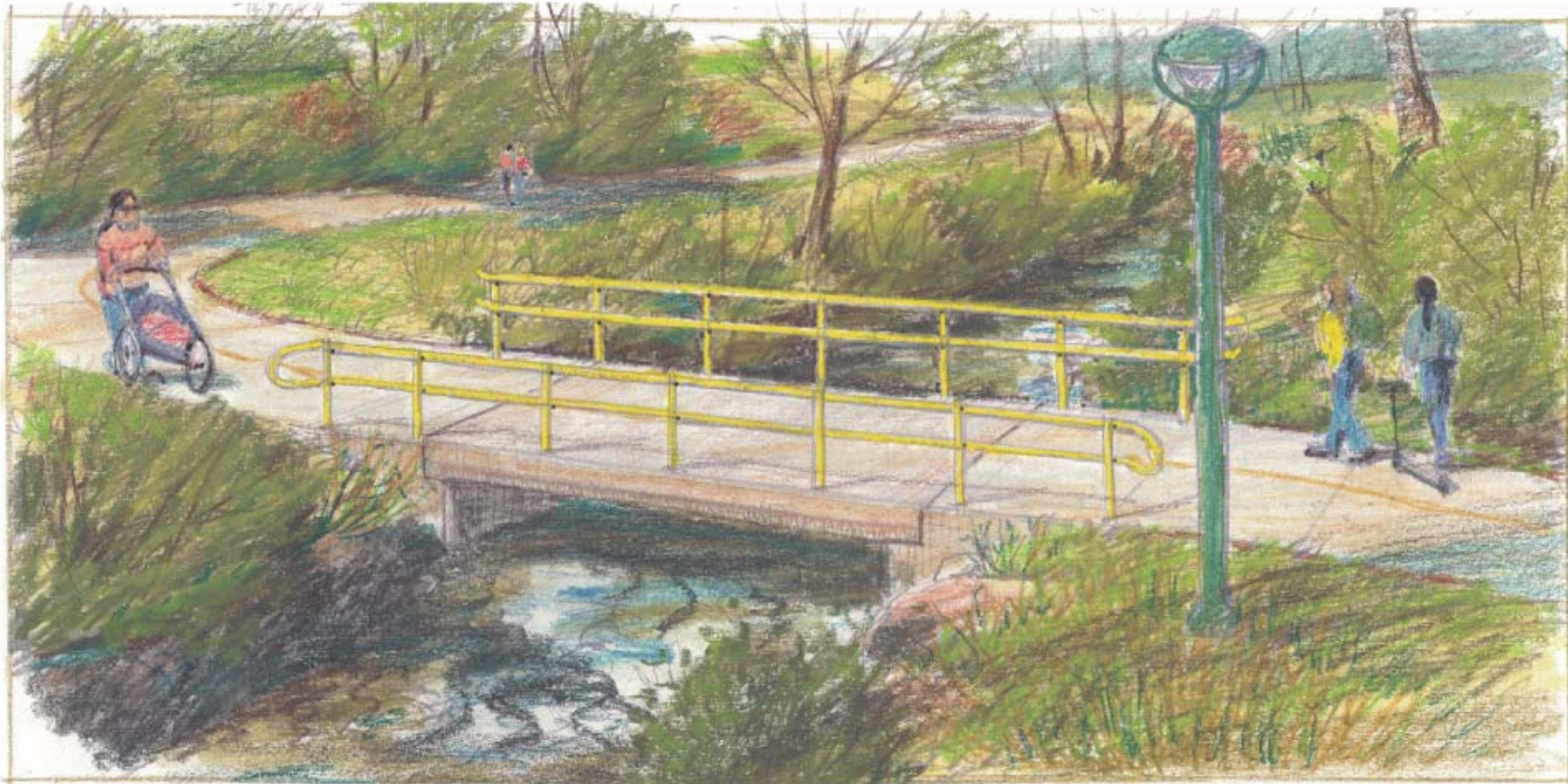
Illustration by: Frank Millenberger Landscape Architect

Trail Centerline with reflective paint. Reflective paint or reflectors may also be appropriate for railings.