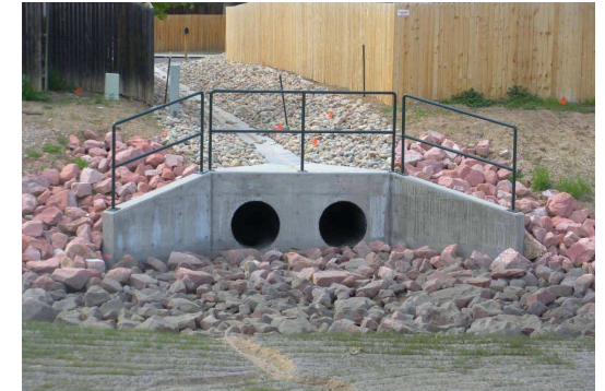
Storm Sewer with Water Quality Pond