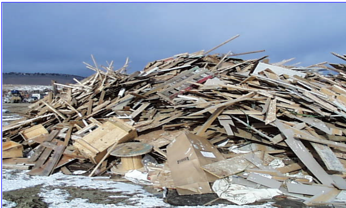
IMAGE 4 – CONSTRUCTION WOOD DEBRIS PILE AT LARIMER COUNTY LANDFILL.