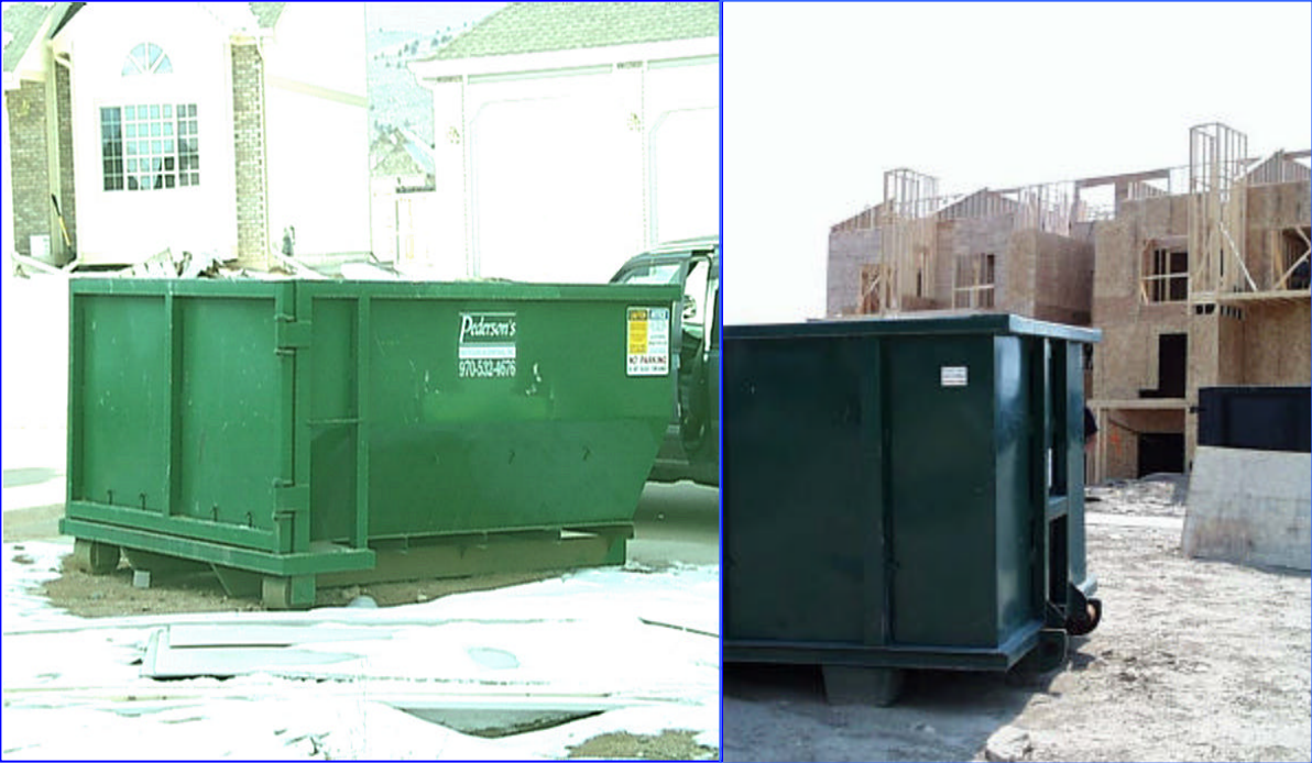
IMAGES 2 AND 3 - 10-CUBIC YARD AND 30-CUBIC YARD PILOT PROJECT CONTAINERS.

On-site contractors notified the hauler (Pedersons) when containers became full, and they were then taken to the Larimer County Landfill to be emptied at a separate staging area. Wood load weights were recorded at the scale at the landfill (located at the recycling plant) and the driver visually estimated the composition of the wood stream (percentage of dimensional lumber, particleboard, and plywood). Estimates of the amount of contamination and trash in the wood containers were also made at this point. Data were recorded by the contractor and submitted on a monthly basis to the City’s project manager.