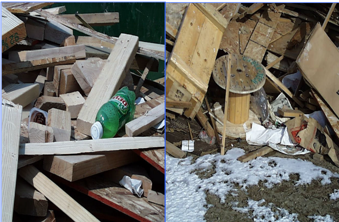
IMAGES 6 AND 7 - CONTAMINATION IN SOURCE SEPARATED CONSTRUCTION WOOD DEBRIS.

Overall, the 3% contamination level is considered minimal and does not significantly impact the ability to process source separated construction wood debris into a landscaping mulch product. Although it was a concern that had been raised by participants, there was no illegal or “midnight dumping” from off-site sources. Images 6 and 7 illustrate contamination that occurred during this project.