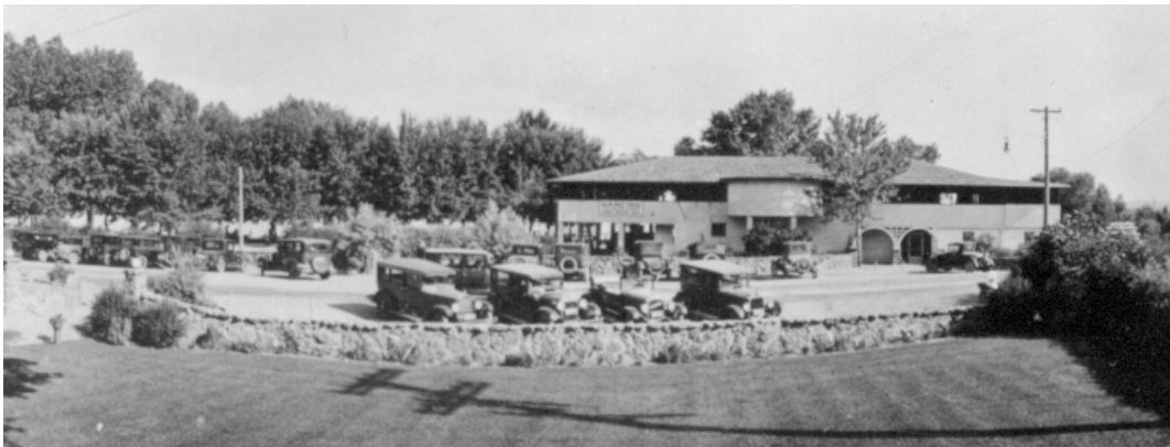
City Park looking southwest toward the Pavilion (Club Tico)