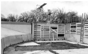
1970 The wooden dock and platform at City Park Pool were replaced with concrete, and the wooden ladders were replaced with steel ones.