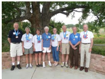
The Fort Collins senior citizens participated in the first Senior Olympics program, now called Senior Games .

1981 Staff produced the first senior citizen newsletter called “The Greening Leaf.”