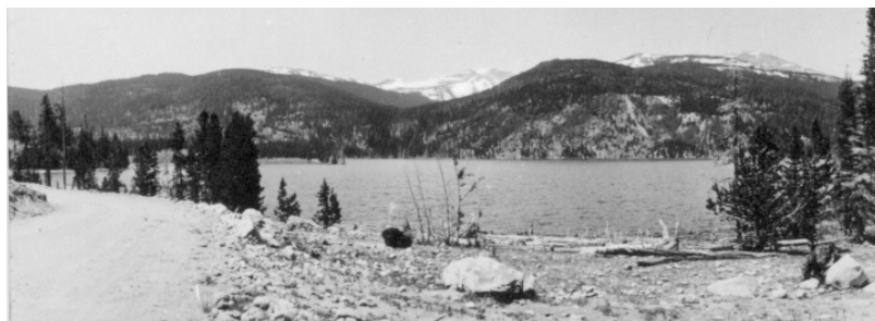
Chambers Lake and Colorado Highway 14