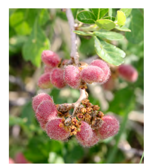
Skunkbush Rhus trilobata (Sumac family) native Native americans used the wood for arrows and made a lemonade-like drink from the berries