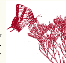
Butterfly on Rabbitbrush

Most of the woody shrubs to the east are rabbitbrush. They are loaded with bright yellow flowers in late summer and fall. Butterflies and other nectar feeders feast on this abundance. Sparrows shelter in rabbitbrush and eat its seeds all winter long.