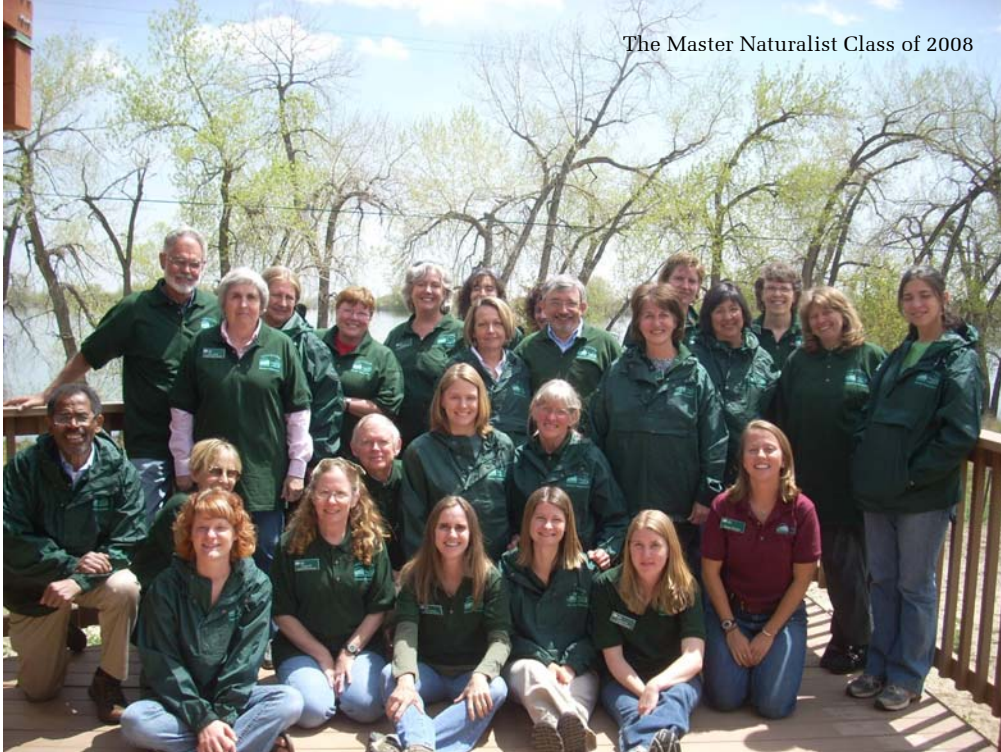
The Master Naturalist Class of 2008