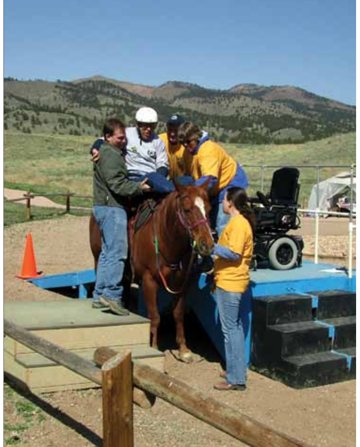
Front Range Exceptional Equestrians at Bobcat Ridge before the new mounting ramp