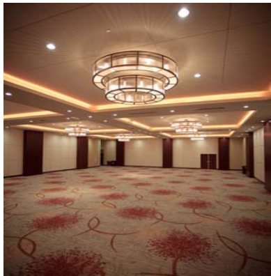
Canyon West Ballroom

Catering The Lincoln Center does not provide any in-house catering services. All caterers must be approved by The Lincoln Center thirty (30) days prior to the event date. There is NO self-catering of any kind. All outside food/snacks must be pre-packaged from a licensed facility.