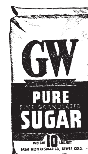
Figure 6. Great Western 10-pound bags of granulated sugar changed through the decades. (Great Western promotional material)