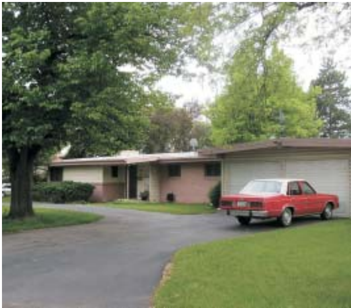
1605 Sheely Drive

Drive Historic District, the first 1950s Landmark District to be designated in Colorado.