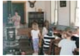
Pre-Kindergarten Summer Class

Also, the Fort Collins Museum sponsors a yearly summer program aimed at educating children about the heritage of our local community. This year the museum will offer three distinct programs concentrating on different aspects of our community's history. Early American Home Arts, Boxelder Schoolhouse, and Wild West Days are the themes. Home Arts focuses on the difficulty of household chores on the 19th century frontier. Boxelder Schoolhouse requires children to learn in the same fashion as their ancestors in a circa 1905 one-room schoolhouse. Wild West Days explores the lifestyles and cultural legacies of Native Americans, Hispanics, and early pioneers. These efforts make the heritage of Fort Collins an integral part of the learning experience for children.