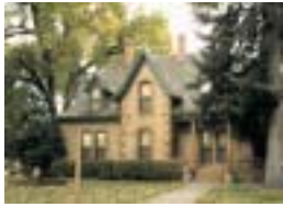
Avery House Historic District