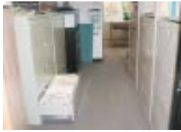
Files at the City's Historic Preservation Office