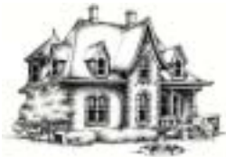
Avery House Historic District