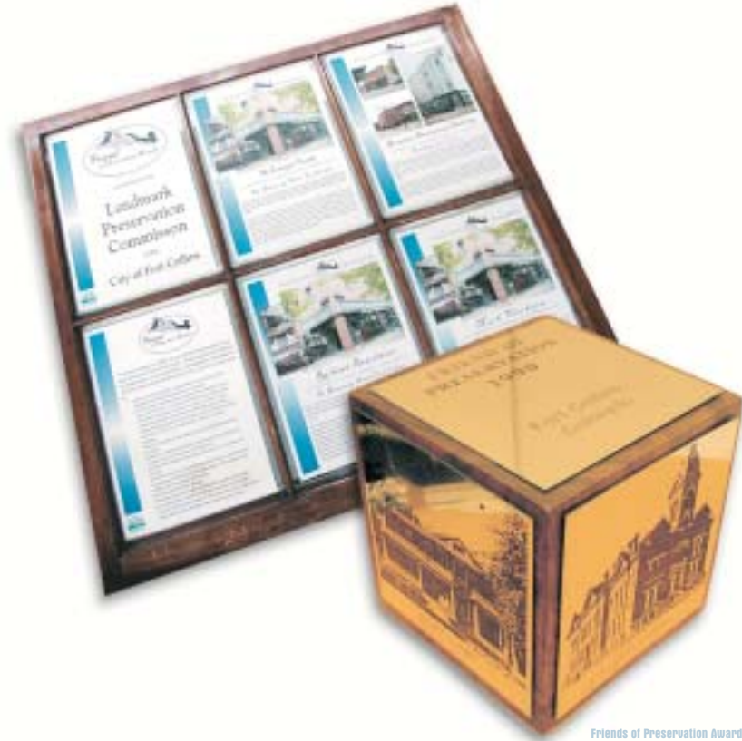
Friends of Preservation Award