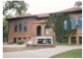
Fort Collins Museum

In 1974, Fort Collins Historical Society was organized with the intent of collecting and preserving historical information, assisting in the identifying and preserving of historic landmarks, completing historical records, and coordinating historical activities in the Fort Collins area. The Society sponsors various activities throughout the year including tours, window displays, programs and community activities.