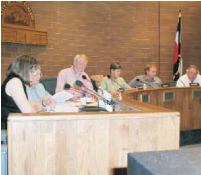
Landmark Preservation Commission

The duties of the LPC include designation of local landmarks and historic districts as well as design review of all exterior changes to locally-designated properties. Once a year, the LPC decides on recipients of the City's Landmark Rehabilitation Loans , a financial incentive for historic preservation. Since 1991, the City of Fort Collins has been a Certified Local Government established under the National Historic Preservation Act.