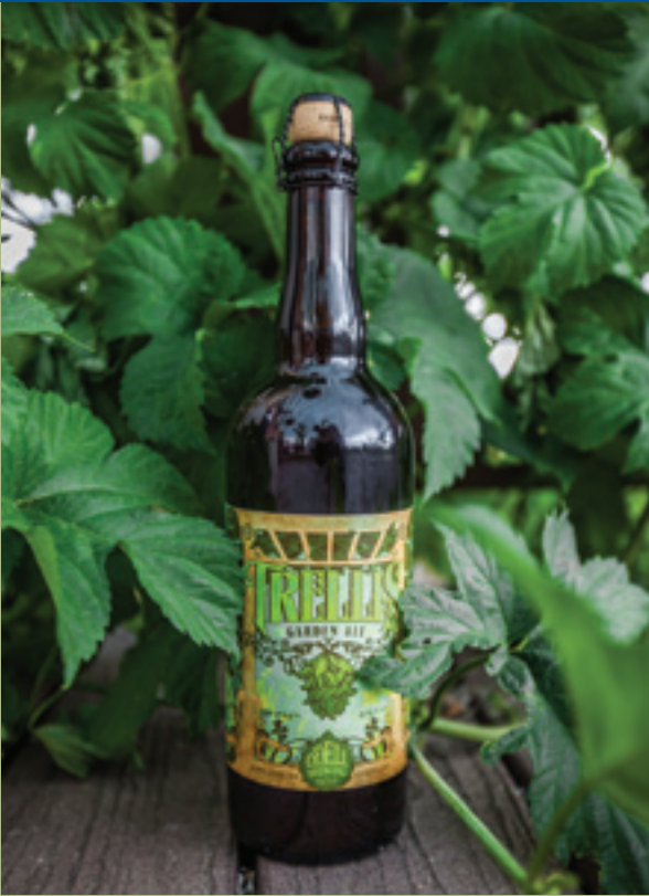
Trellis Garden Ale was brewed by Odell Brewing Company featuring coriander, cilantro, pineapple mint, lavender and rose petals grown at The Gardens. $1 from each bottle of Trellis Garden Ale sold will be donated to the Gardens on Spring Creek in 2015.

Lastly, The Gardens was honored to co-host the American Public Garden Association’s annual conference with our regional partner gardens—Denver Botanic Garden, Cheyenne Botanic Garden and Betty Fort Alpine Garden. It was exciting to show off our garden to colleagues from around the country.