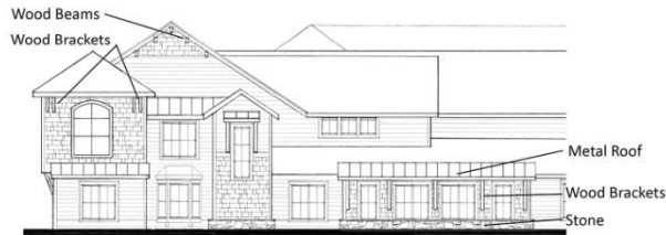
North Elevation Detail