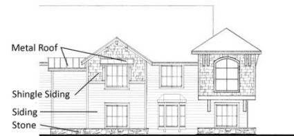
South Elevation Detail