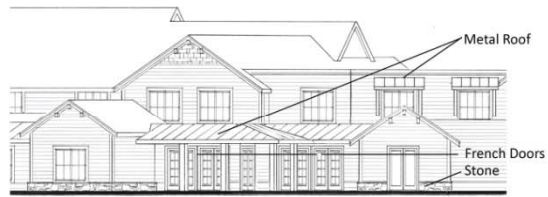
West Elevation Detail