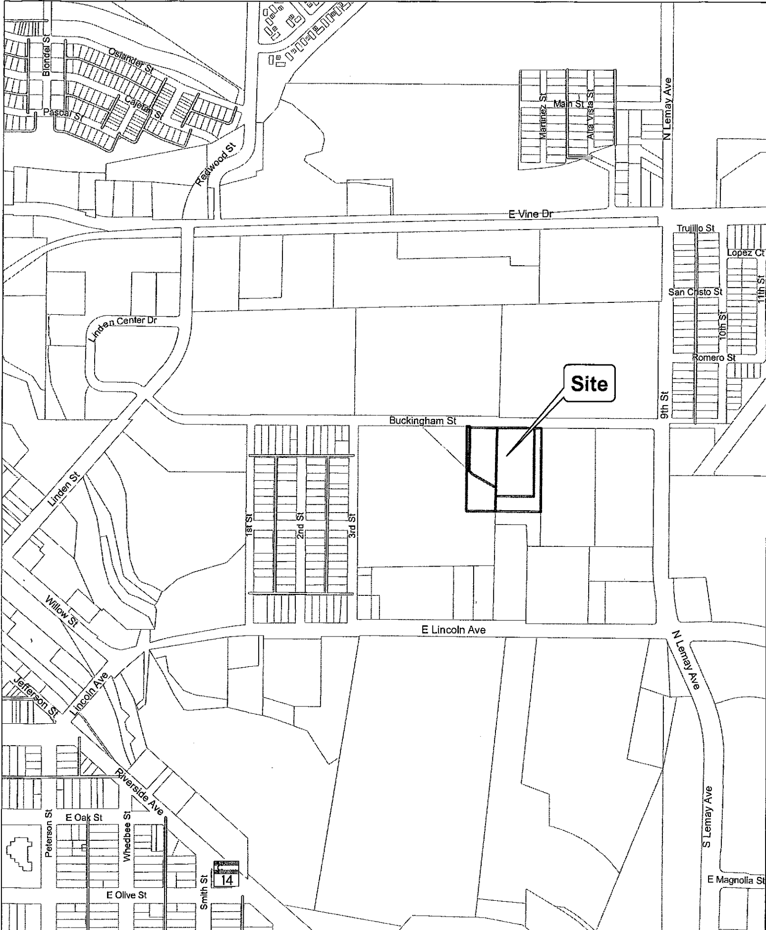
#20-09 - Colorado Iron and Metal, PDP Vicinity Map