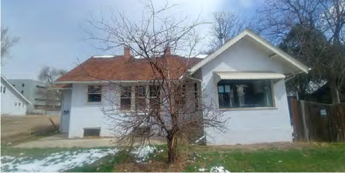
EXISTING SOUTH ELEVATION - 720 W. PROSPECT