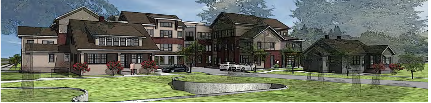
View from Prospect Rd. Looking Northeast