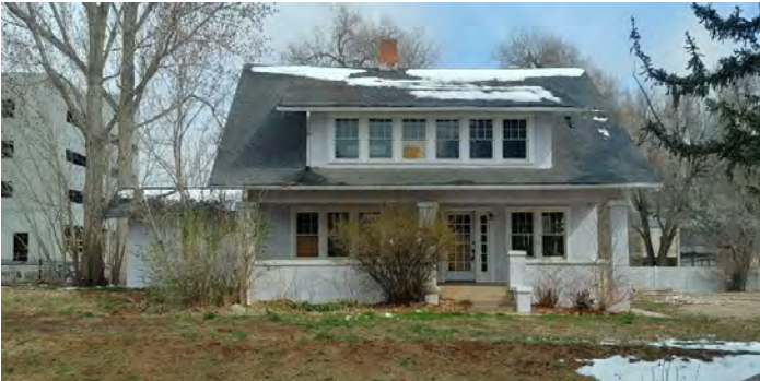
EXISTING SOUTH ELEVATION - 730 W. PROSPECT