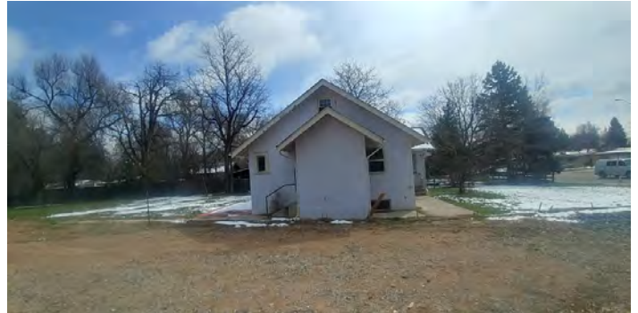
EXISTING WEST ELEVATION - 720 W. PROSPECT