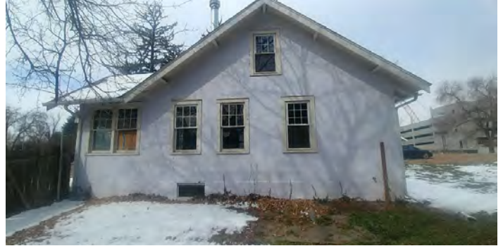
EXISTING EAST ELEVATION - 720 W. PROSPECT