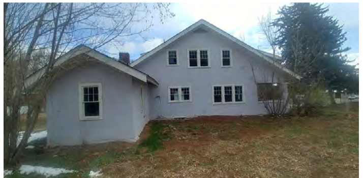
EXISTING WEST ELEVATION - 730 W. PROSPECT