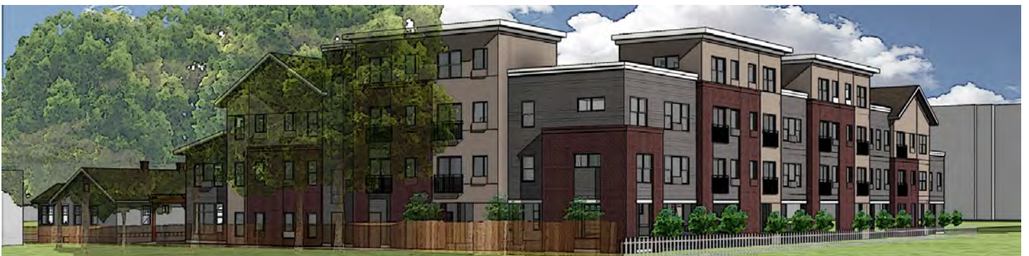
View Looking Southwest