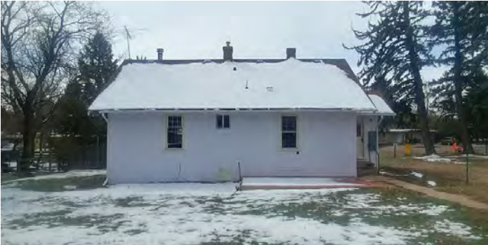
EXISTING NORTH ELEVATION - 720 W. PROSPECT