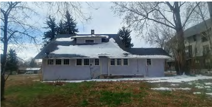
EXISTING NORTH ELEVATION - 730 W. PROSPECT