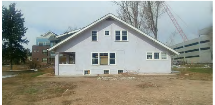
EXISTING EAST ELEVATION - 730 W. PROSPECT