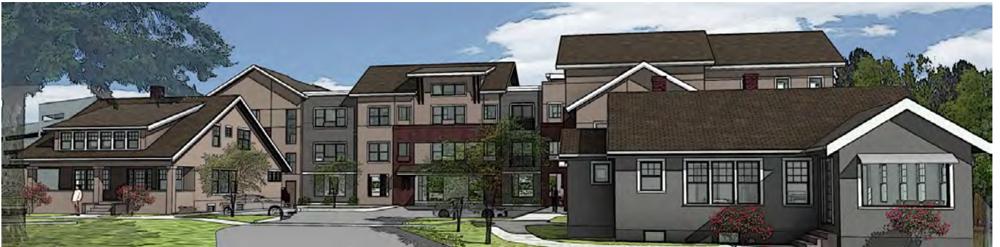
View from Prospect Rd. Looking North