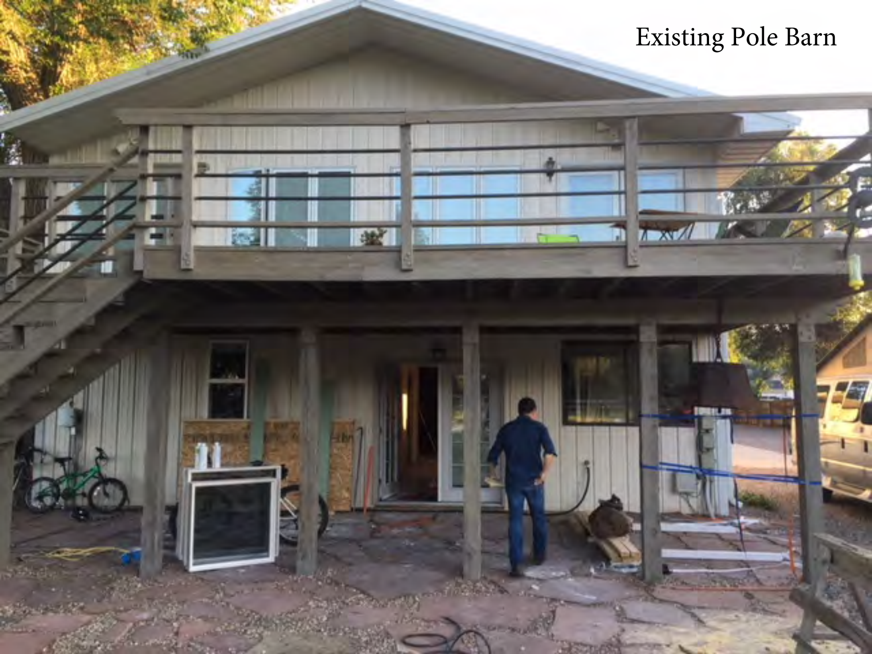
Existing Pole Barn