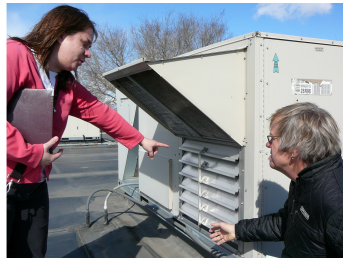
Climate Wise technical assessment at The Vineyard Church