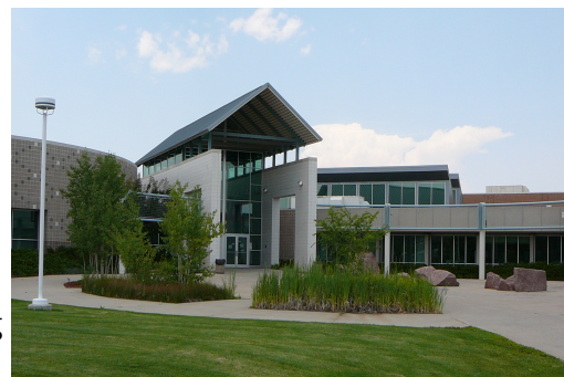
Rocky Mountain High School