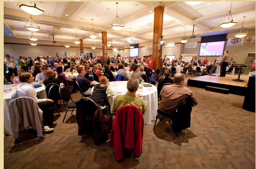
2010 EnvirOvation event