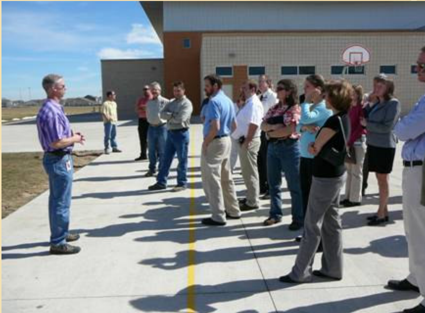
Partner Talk and Tour