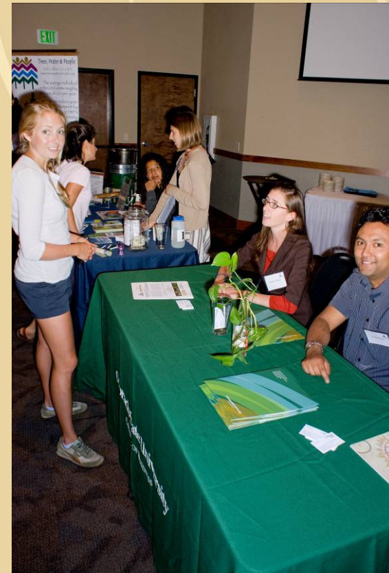
2010 Climate Wise Fall Fair