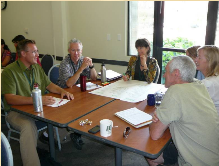
2010 Advisory Committee