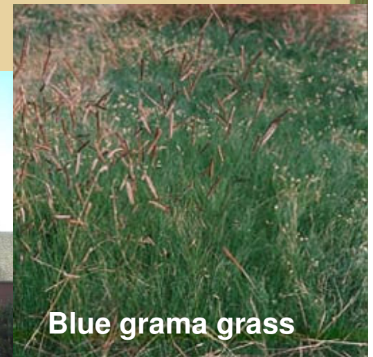
Blue grama grass