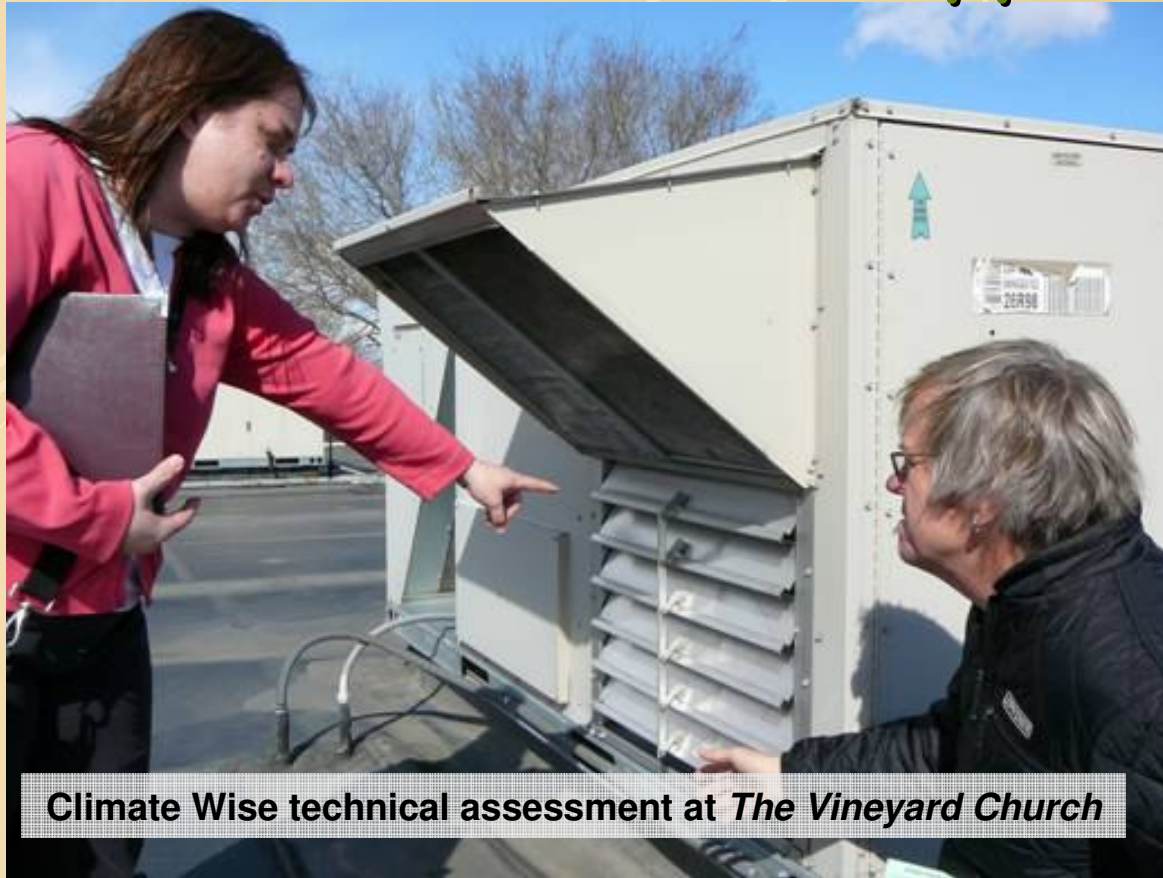
Climate Wise technical assessment at The Vineyard Church