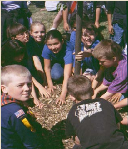
PSD Arbor Day