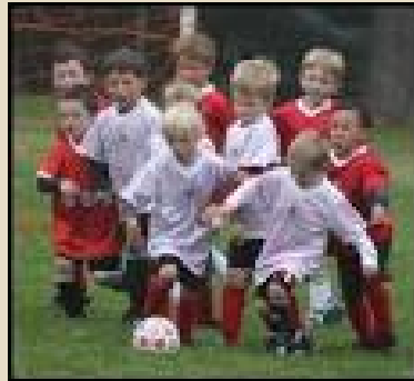
Fort Collins Soccer Club