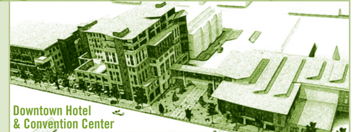
Downtown Hotel & Convention Center

WHAT MAKES DOWNTOWN DOWNTOWN? THE unique shopping, great restaurants, and entertainment? The parks, history, and special events? The indescribable and distinctive "vibe?" If you've been downtown recently you know the answer: all of the above.