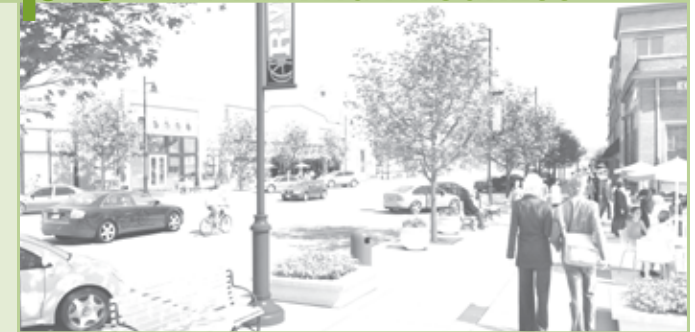
Artist rendering of the River District, fcgov.com/riverdistrict

The City has worked with private industry to develop four out of five key industry clusters including clean energy, bio-science, software, and hardware. Industry cluster is a term used in communities around the country that group certain businesses by the industry in which they operate. High functioning clusters not only provide networking opportunities for existing businesses, but they can also facilitate opportunities for collaboration and help establish Fort Collins as a leader in certain industries.