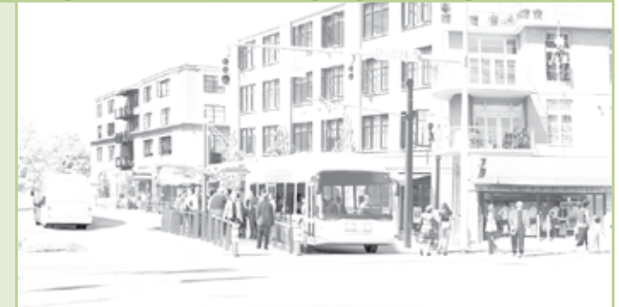
Artist rendering of the NE corner of Drake and Mason

Opportunities for development and redevelopment will largely focus on areas surrounding the new MAX stations. "This type of development around stations often build on existing assets to create vibrant communities including entertainment centers, housing,