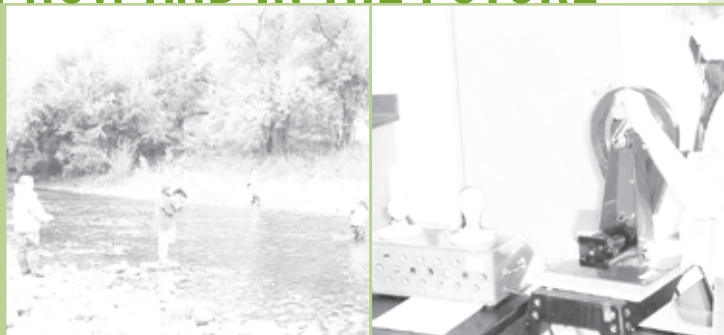
Left: Student Watershed scientists at work. Right: Using pedal power to light a CFL

Educators are encouraged by students’ interest in these important issues. “As teachers, we value Fort Collins Utilities’ role