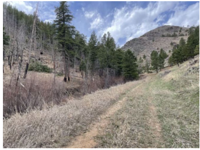
New Addition to Crossline Canyons Natural Area

Two new land acquisitions totaling 44.26 acres were made in the second quarter including an addition to the Cooper Slough conservation area and eight acres adjacent to Crossline Canyons Natural Area. The lands support wildlife habitat and may provide trail access in the future.