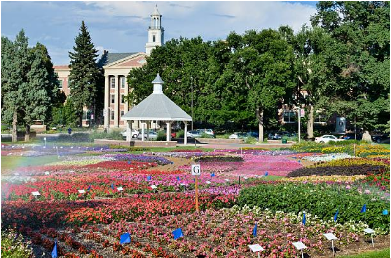
Colorado State University Flower Trial Gardens