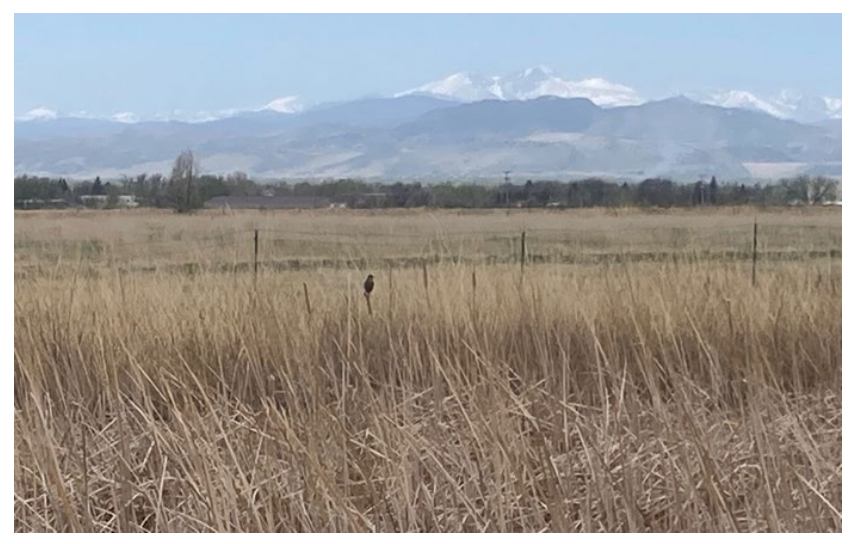
New addition to Cooper Slough conservation area

Note: The "Total Conserved - Life to Date" cost in the above table has been updated to reflect only Natural Area's portion of total acquisition costs to date. In recent previous quarterly reports, this value was reported as the total purchase price of all acquisitions to date, including any partner or grant contributions.