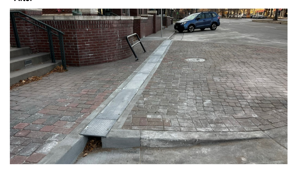
261 Pine St - After