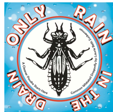
City of Fort Collins 2013 Storm Drain Markers