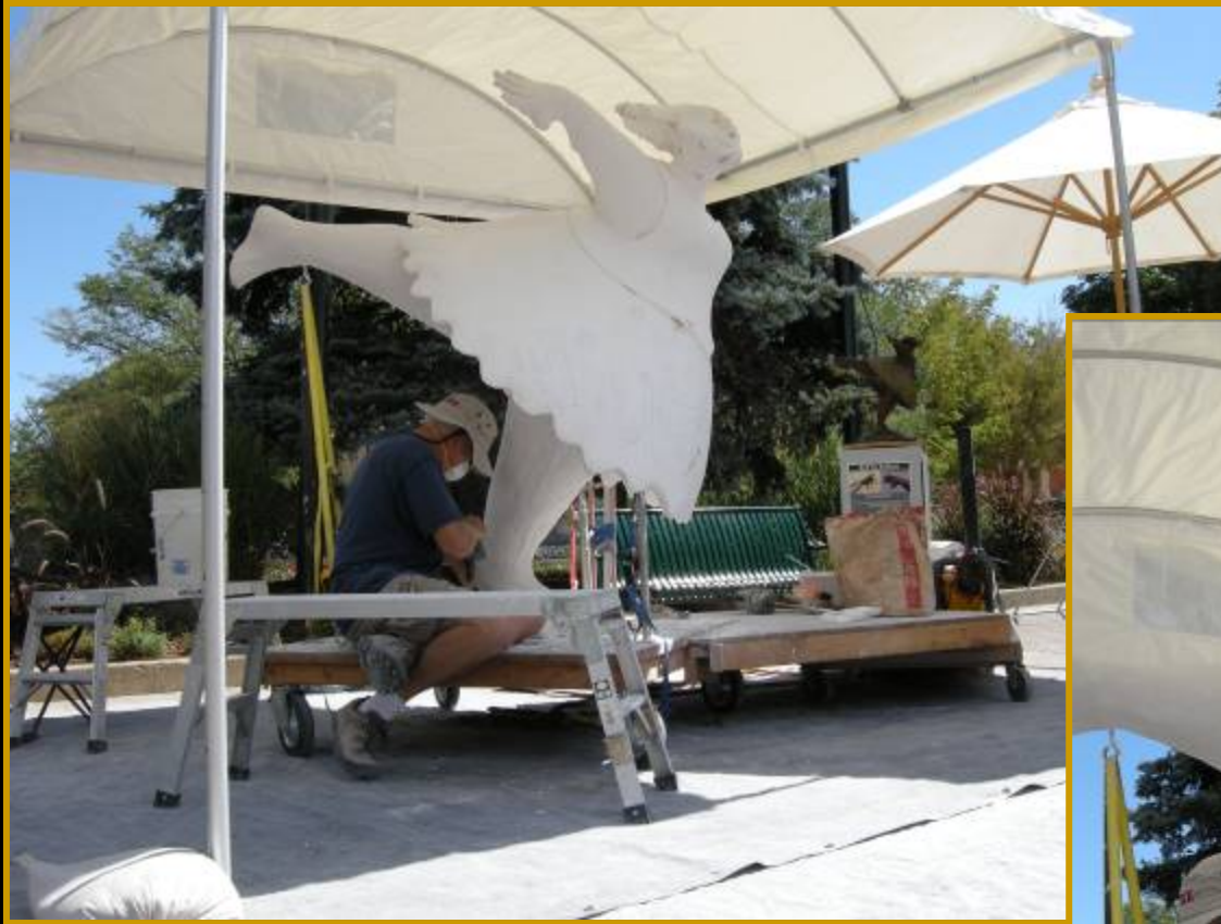
Shaping the plaster