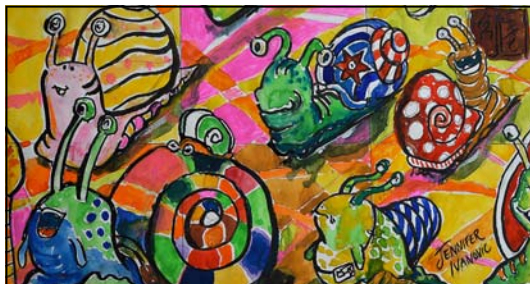
West side/faces MAX buses