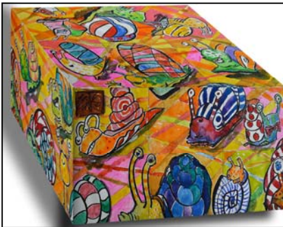
From parking lot view

Each unique Snail has a patterned body and complimentary shell design, with lots of silly smiles. The “Snail Herd” has caused a multi-colored, slime-paved background. The slime paths are vibrant warm colors and a strong shadow under each Snail for easy viewing from a moving MAX bus. This design compliments Ren Burke’s adjacent "Horse Herd". I was inspired by my eight-year-old son’s recent drawings of snails. If I could choose to be any animal, it would a snail - as I would always be comfortably at home!